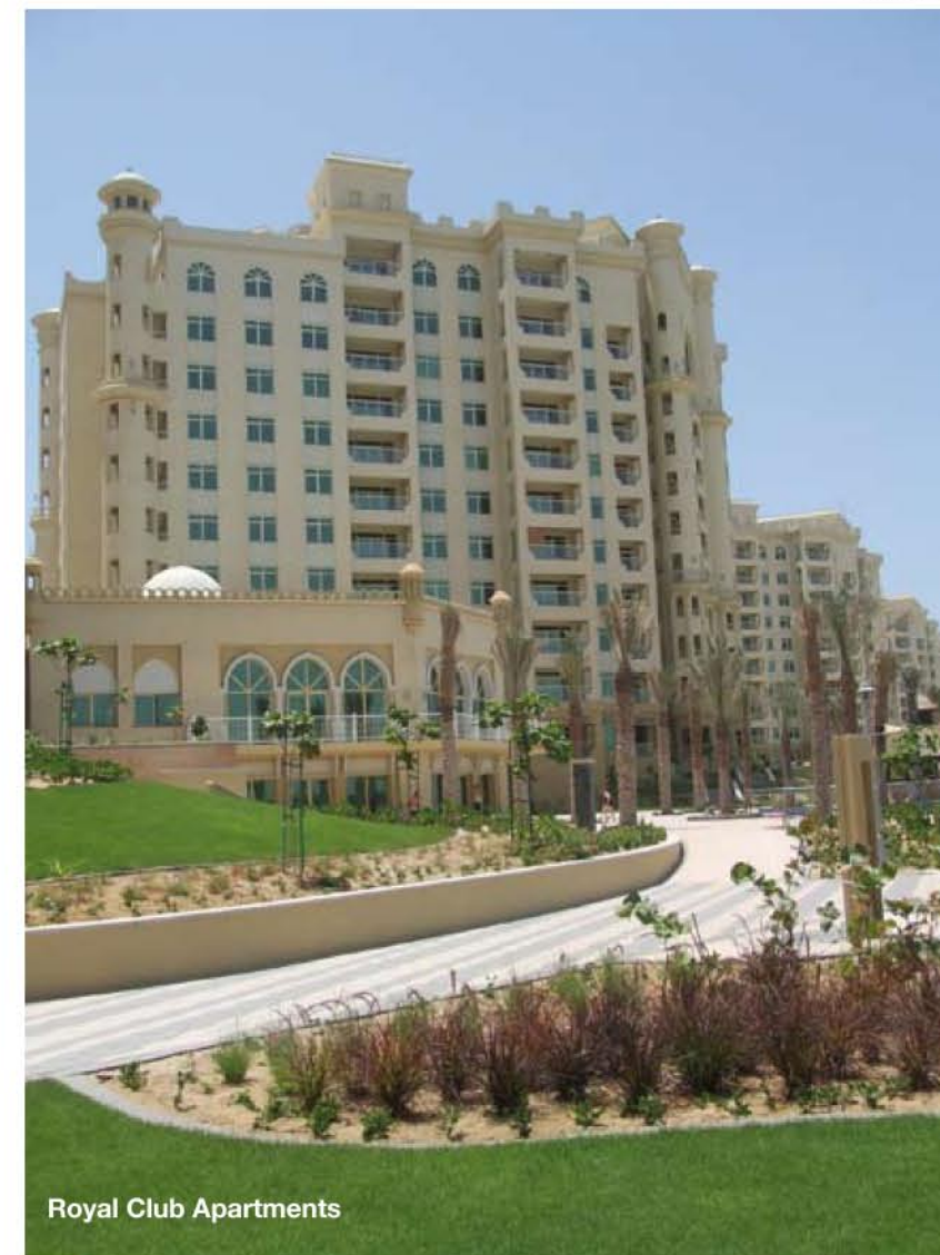
Royal Club Apartments

Due to the great success with the Royal Club at the Palm Dermarr Properties Limited signed a marketing agreement with Arabian Falcon to sell and market its news acquisition Royal Club at Downtown Dubai which is situated in the most prestigious Kilometer in the world at downtown Dubai. It consists of 100 units and located in the Heart of Dubai . Its within walking distance from Dubai Mall the largest Mall in the region and has the view of Burj Dubai. In real estate the most important three is location ,location and