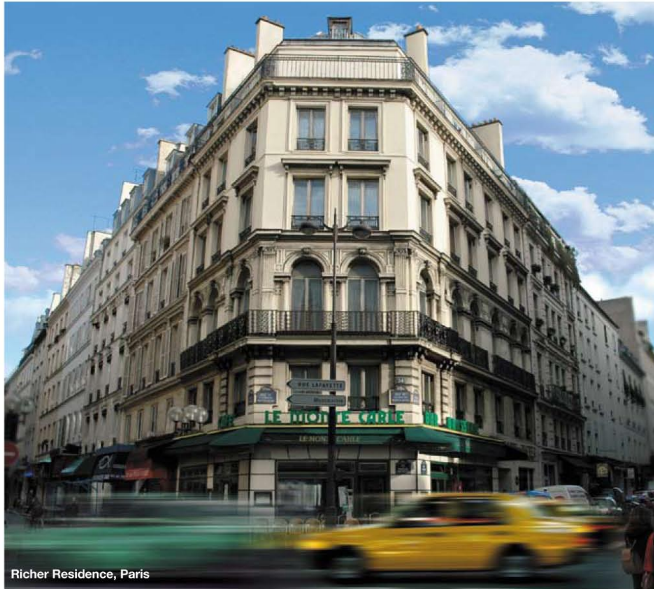
Richer Residence, Paris

location and we don't think you can have a better location than this .We are very fortunate to have established a formula for developers to venture in this industry with minimum risk .