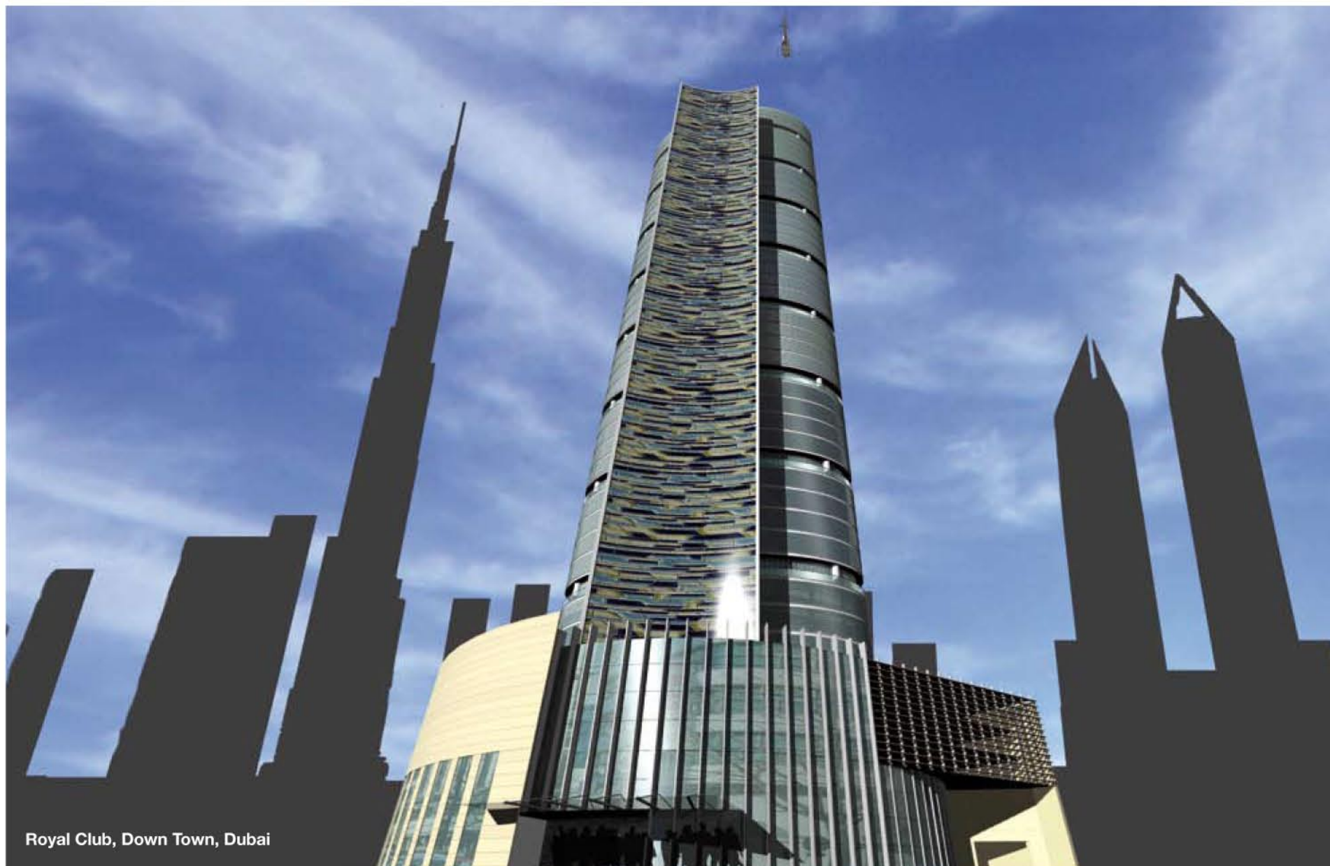
Royal Club, Down Town, Dubai

the units and they are in their final stages of fitting the reception area and the backroom offices. We expect that the 50 units will be ready in December 2007 and we will be pleased to start receiving our valuable owners.